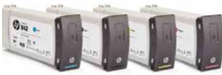
8 (2 x 775-ml per color with auto-switch)

The HP PageWide XL 8000 Printer includes a stationary 40-inch (101.6-cm) printbar that spans the whole printing width. As paper moves under the printbar, the entire page is printed in one pass, enabling very high printing speeds.